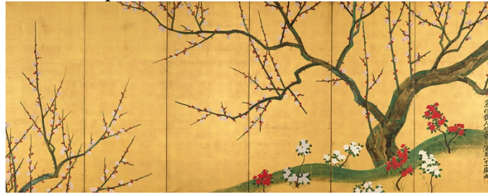
Figure 1. Plum Trees, Ogata Kenzan (1663-1743)

they used usually had high saturation. The landscapes in Rinpa art are usually Japanese local landscape scenes, such as low-slope hills.