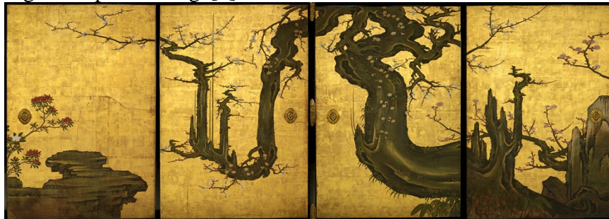
Figure 2. Old Plum Tree, Kano Sansetsu (1589-1651)

Kano Sansetsu, the artists of Old Plum Tree (see fig.2), is a Kano artist. Kano school was regarded as the most prestigious art school in early Edo period, because it enjoyed the patronage from Tokugawa Shogunate. Known for its special mixture of Chinese and Japanese styles, it served the military class. All the Kano artist from the Kano family and received very strict “imitating” training to keep the lineage[5].